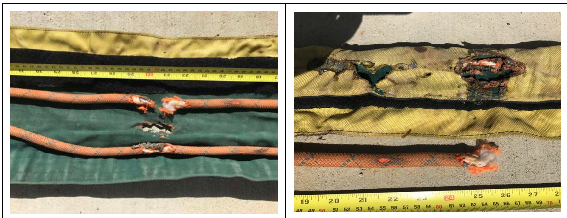
Figure 2: Damaged ropes and rope protector